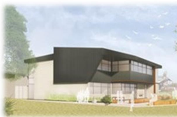
Year 9 Learning Centre

The Performing Arts Centre, cafeteria and the Siena general-purpose classroom building were all opened in 2019. They have been a great inclusion for our community and the students are now reaping the rewards of these state-of-the-art facilities. These new facilities provide a rich and stimulating learning environment for all our students to flourish and reach their full potential. Plans are also well underway for the construction of the Year 9 Learning Centre, with construction expected to start in early 2020, and to be completed for the start of the 2021 school year. When completed this will allow for the renovation and extension of the College library into the existing MacKillop building, doubling the size of the library.