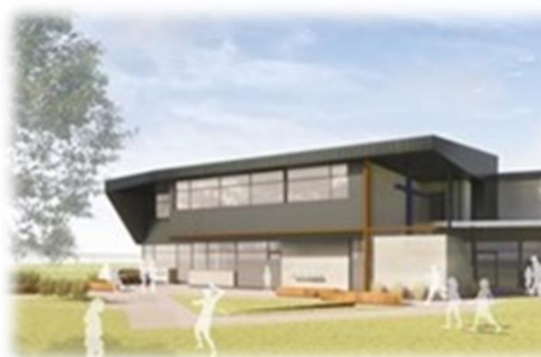
Year 9 Learning Centre

Caroline Springs and the surrounding suburbs including Plumpton, Fraser Rise and Deanside are a rapidly growing area and vastly expanding. Enrolments at the local Catholic and Government schools are high and are continuing to grow. Caroline Springs has a large Catholic demographic and demand for Catholic education has been steadily increasing. Our current percentage of Catholic enrolments at the College is 98%.